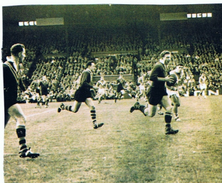
In full flight against France in Paris in 1959