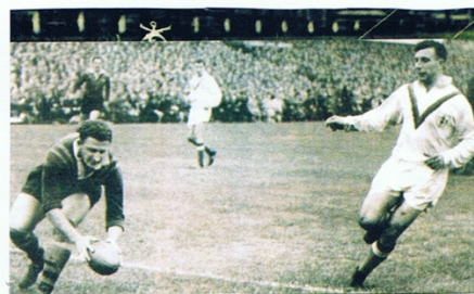
Scoring a try against Great Britain at Swinton in 1959