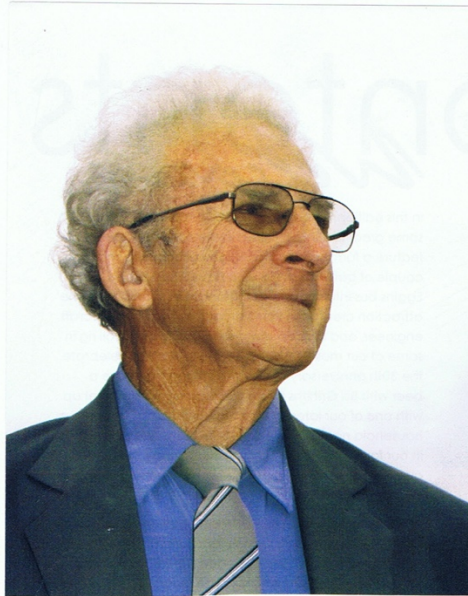
Harry Wells to day

Harry Wells, one of Australia's greatest rugby league players of all time, one who played during the 1950's, 60's and 70's in an era of what many rugby league followers would say was the games greatest period – "pure rugby league" as it should be played, not that which we have to watch today. (I'm not a fan as you can see of the modern game).